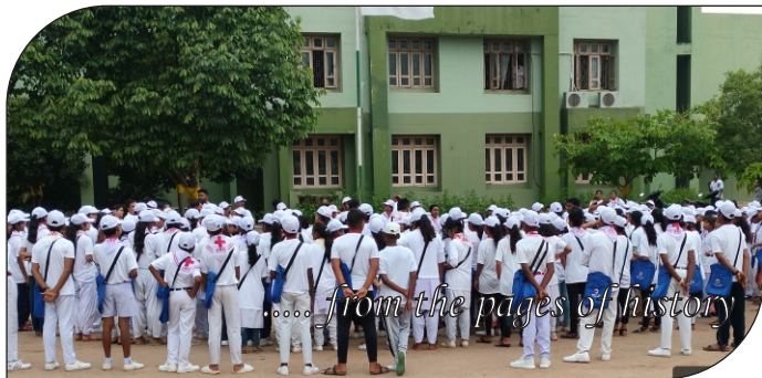
State Level Junior Red Cross Study-cum-Training Camp # Nilachal Campus