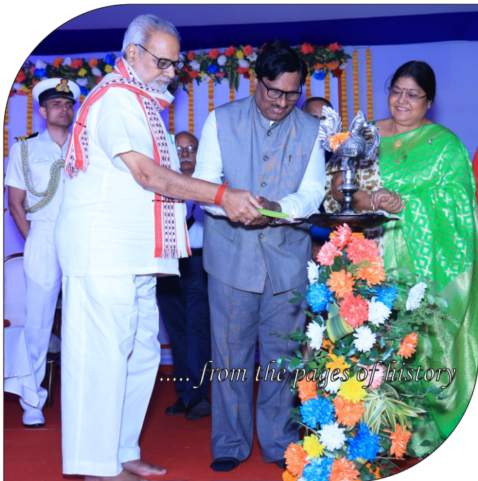
Lightening of lamp by Hon'ble Chief Guest and other Guests