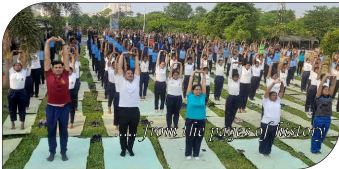
NCC Cadets (Girls) of Annual Training Camp # Nilachal Campus