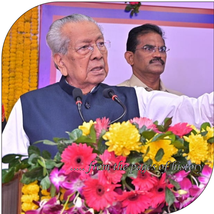
Hon'ble Governor of Andhra Pradesh, Biswa Bhusan Harichandan addressing the Audience